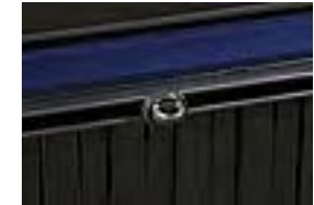
Mini Tie Down Loop $40.00 Installed MSRP*