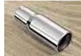
Exhaust Tip by Valor $69.00 Installed MSRP*