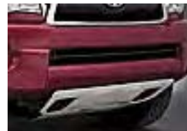
Front Skid Plate $205.00 Installed MSRP*