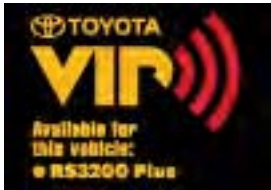
RS3200 + Security System $479.00 Installed MSRP*