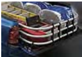
Bed Extender $282.00 Installed MSRP*