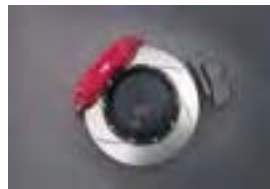
TRD Performance Brake Kit $2,499.00 Installed MSRP*