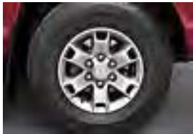
Baja 16 Alloy Wheels $695.00 Installed MSRP*