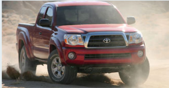
Access Cab 4x4 V6 shown in Impulse Red with available TRD Off-Road Package