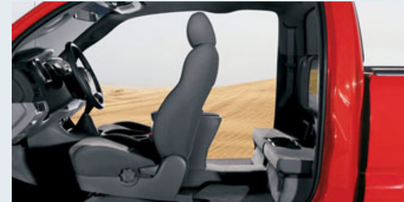
4x4 Access Cab V6 interior shown in Graphite with available TRD Off-Road Package