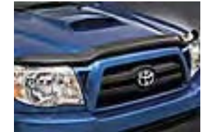
Hood Protector $119.00 Installed MSRP*