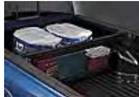
Cargo Divider $279.00 Parts Only MSRP**