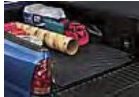
Bed Mat $119.00 Installed MSRP*