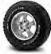
TRD 16" 5-Spoke Off Road Alloy Wheel $1,999.00.00 Installed MSRP* Pre Runner and 4x4 Only