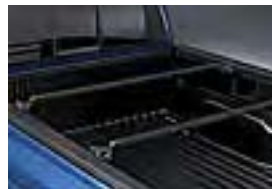
Cargo Cross Bars $124.00 Parts Only MSRP**