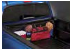
Cargo Net $49.00 Installed MSRP*