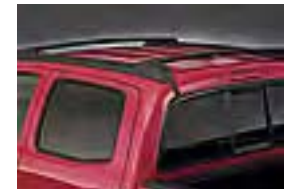
Roof Rack $339.00 Installed MSRP*