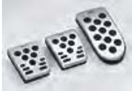
Sport Pedals by OBX Racing $79.00 Installed MSRP*