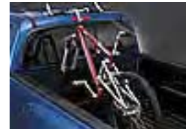
Fork Mount Bike Attachment $49.00 Parts Only MSRP**