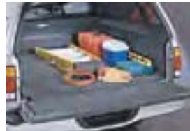
Bedrug Carpet Bedliner by Wise Industries $379.00 Parts Only MSRP**