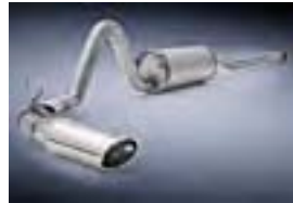
TRD Cat-Back Exhaust System V6 C & D Cab $520.00 Installed MSRP* V6 D Cab Long Bed $535.00 Installed MSRP*