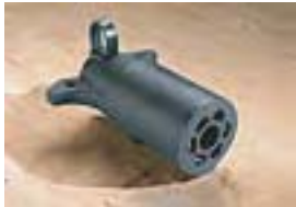
7 Pin to 4 Pin Adaptor $13.00 Installed MSRP*