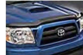
Hood Protector $119.00 Installed MSRP*