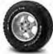
TRD 16" 5-Spoke Off Road Alloy Wheel $1,999.00.00 Installed MSRP* Pre Runner and 4x4 Only