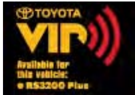
RS3200 + Security System $479.00 Installed MSRP*