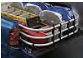
Bed Extender $282.00 Installed MSRP*