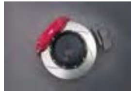
TRD Performance Brake Kit $2,499.00 Installed MSRP*