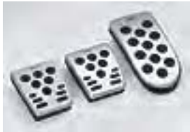
Sport Pedals by OBX Racing $79.00 Installed MSRP*