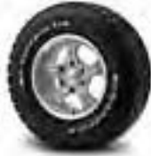
TRD 16" 5-Spoke Off Road Alloy Wheel $1,999.00.00 Installed MSRP* Pre Runner and 4x4 Only