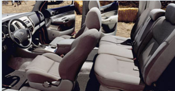
Tacoma Double Cab interior shown in Graphite with available TRD Off-Road Package