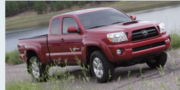
PreRunner Access Cab V6 shown in Impulse Red Pearl with available TRD Sport Package