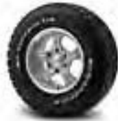
TRD 16" 5-Spoke Off Road Alloy Wheel $1,999.00.00 Installed MSRP* Pre Runner and 4x4 Only